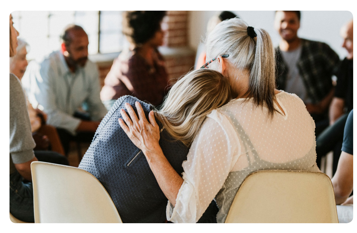
Global Mental Health Research: Sustainable Strategies Across the Lifespan Tuesday, September 3 MARC 290