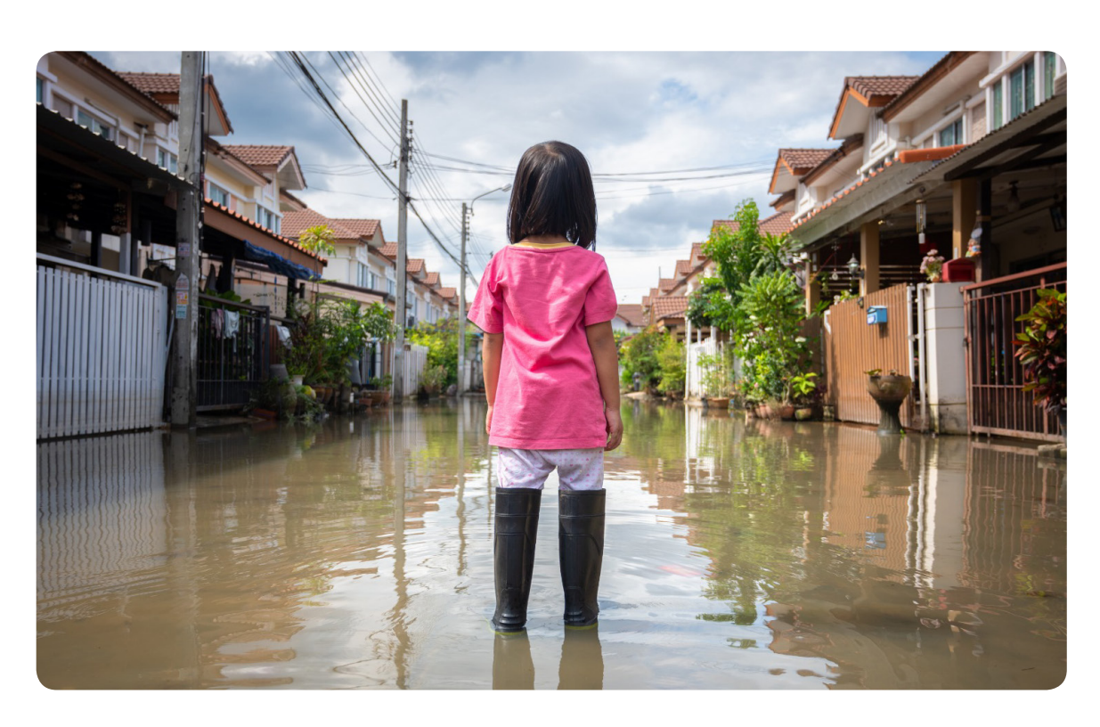
The Intersection between Climate Change and Health Wednesday, September 4 MARC 290