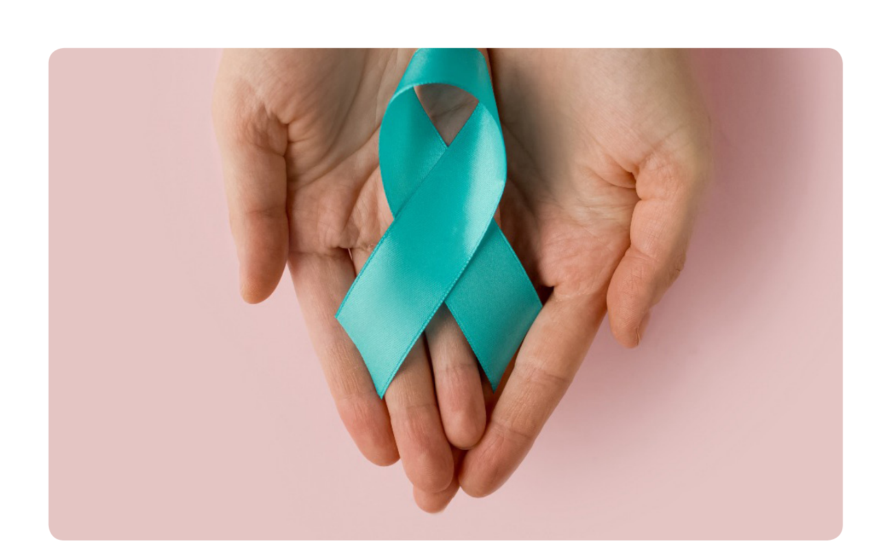
Control Cervical and Uterine Cancer in Latin America and the Caribbean Tuesday, September 3, and Wednesday, September 4 Room 355, Graham Center