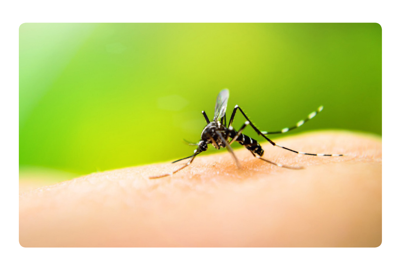
Management of Patients in the ICU with Suspicion of Dengue Fever Tuesday, September 3, through Thursday, September 5 Room 243, Graham Center