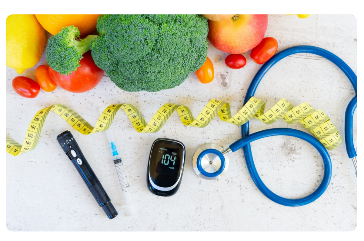
Noncommunicable Diseases in Latin America: Obstacles, Challenges and Opportunities Thursday, September 5 Room 355, Graham Center