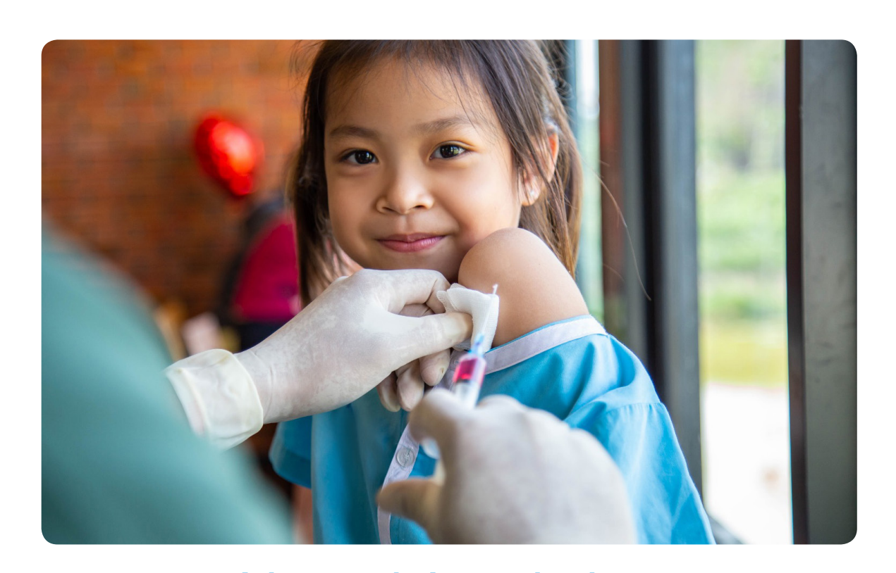
Advances in Immunizations: Implementing Vaccination Across the Lifecycle. Sharing Experiences between Latin America and Asia Tuesday, September 3, through Thursday, September 5 Main Ballroom at the Graham Center

Click on the image of your interest group to access the agenda